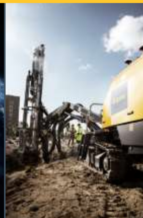
Surface civil engineering and urban development