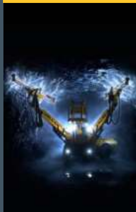
Underground civil engineering