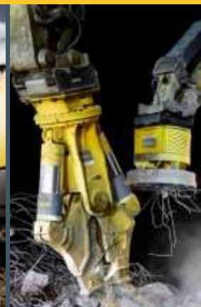
Deconstruction and recycling