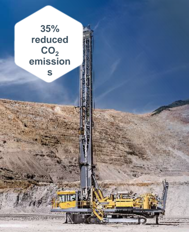
Autonomous PitViper 271 with AutoDrill2